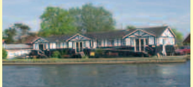
Pictured: Horning Lodges 3, 2, 1

King Line Lodge complex of five Lodges enjoy a superb location overlooking one of the most picturesque parts of the River Bure in Horning.